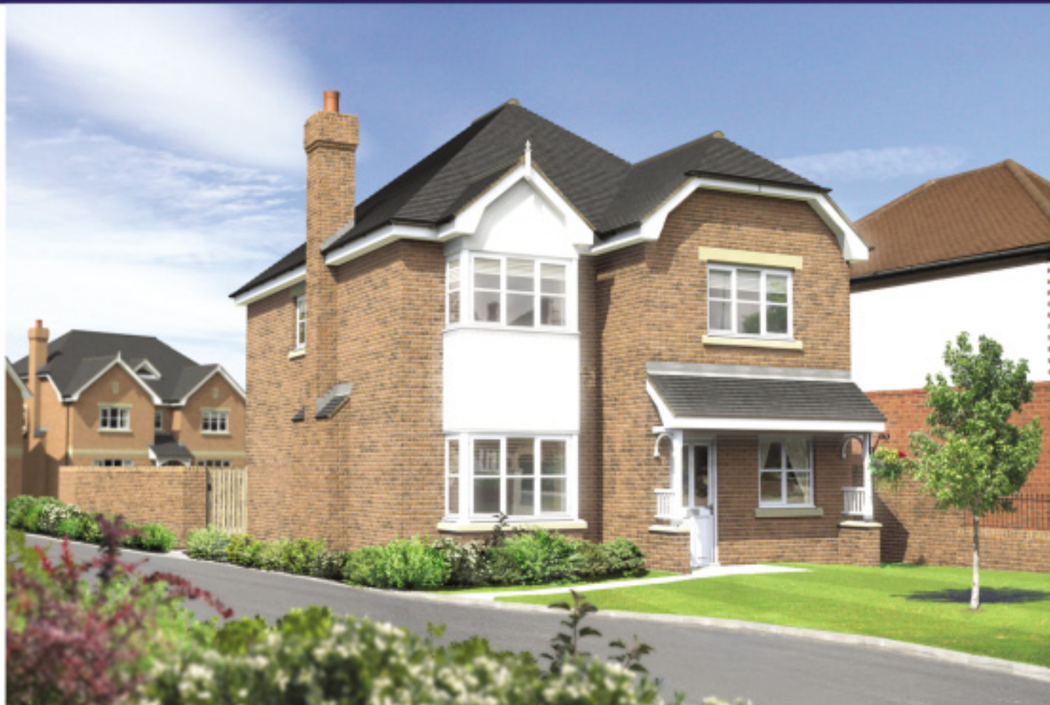
COMPUTER GENERATED ILLUSTRATION OF THE DENBY HOUSE TYPE ON PLOT 6

AN EXCLUSIVE DEVELOPMENT OF 4 & 5 BEDROOM HOMES